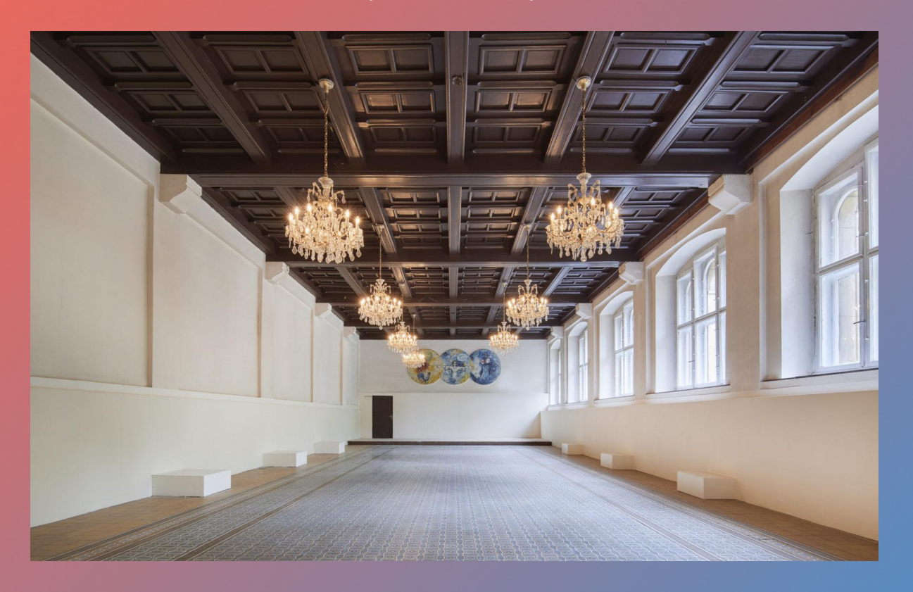
(Second lecture hall)